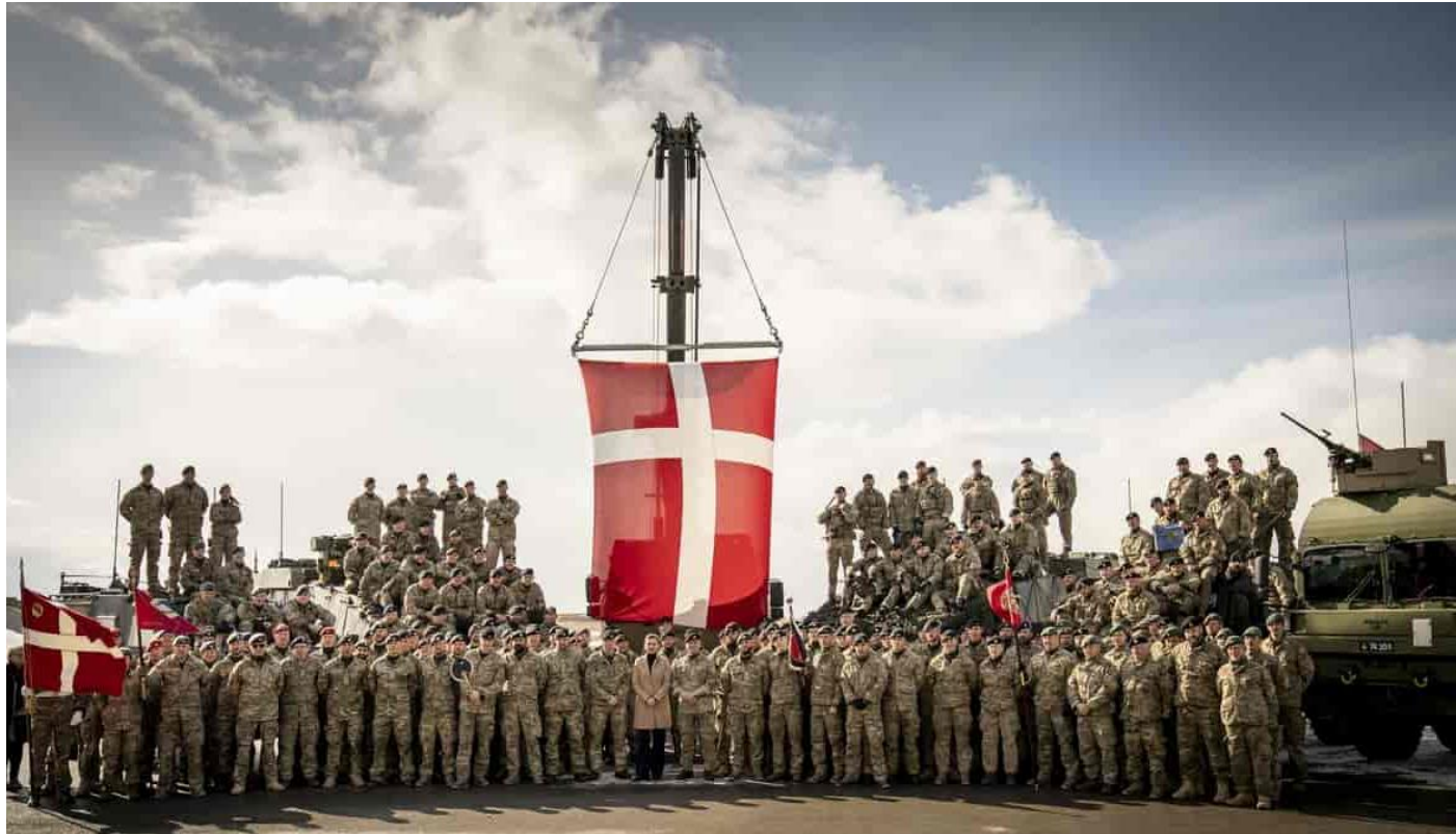
Danish PM Mette Frederiksen on her visit to the Danish military in Estonia, 2022. (part of the NATO EFP – Enhanced Forward Presence)